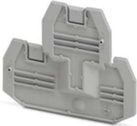
End cover, length: 69.9 mm, width: 2.2 mm, height: 57.5 mm, color: gray

Please be informed that the data shown in this PDF Document is generated from our Online Catalog. Please find the complete data in the user's documentation. Our General Terms of Use for Downloads are valid ( http://phoenixcontact.com/download )